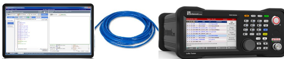
[Figure 1] Connection between PC and RWC5020A

Connect PC and RWC5020A with cross LAN cable.