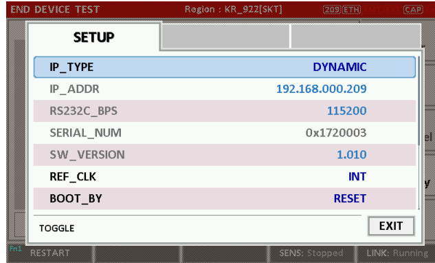
[Figure 2] SETUP screen of RWC5020A